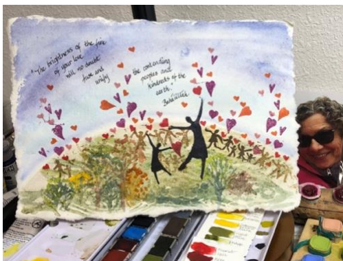
Art piece submitted for Submission to Green Acre Art Show 2022-2023 Show Theme: Creative Power of UnityMixed media - Pen & ink, watercolour, handmade stamps on handmade paper from India. The quote reads: "The brightness of the fire of your love will no doubt fuse and vivify the contending peoples and kindreds of the earth." Bahá'u'lláh