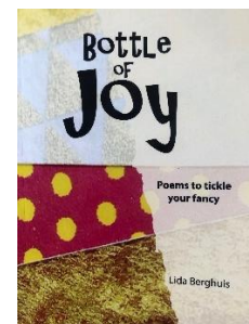
Bottle of Joy: Poems to tickle your fancy